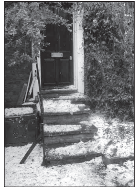
The doorstep at 33 Iveley Road