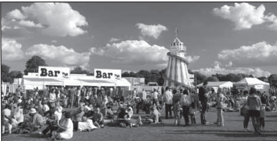
Saturday 28 July and Sunday 29 July – Ben and Jerry’s held their popular family weekend on Clapham Common again

Saturday 11 August – Quantum Theatre presented their adaptation of Treasure Island with live music on Clapham Common Bandstand. This was a free family show, on a hot sunny day, well attended by an appreciative audience and one of several events on the Bandstand during August.